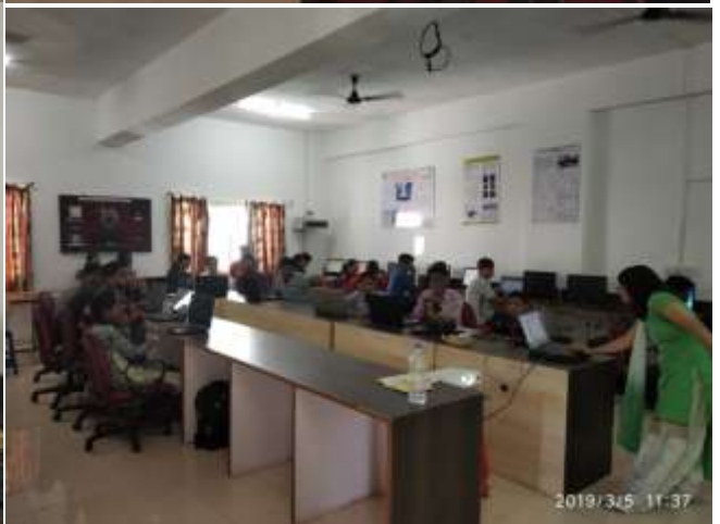
Hands on Practice